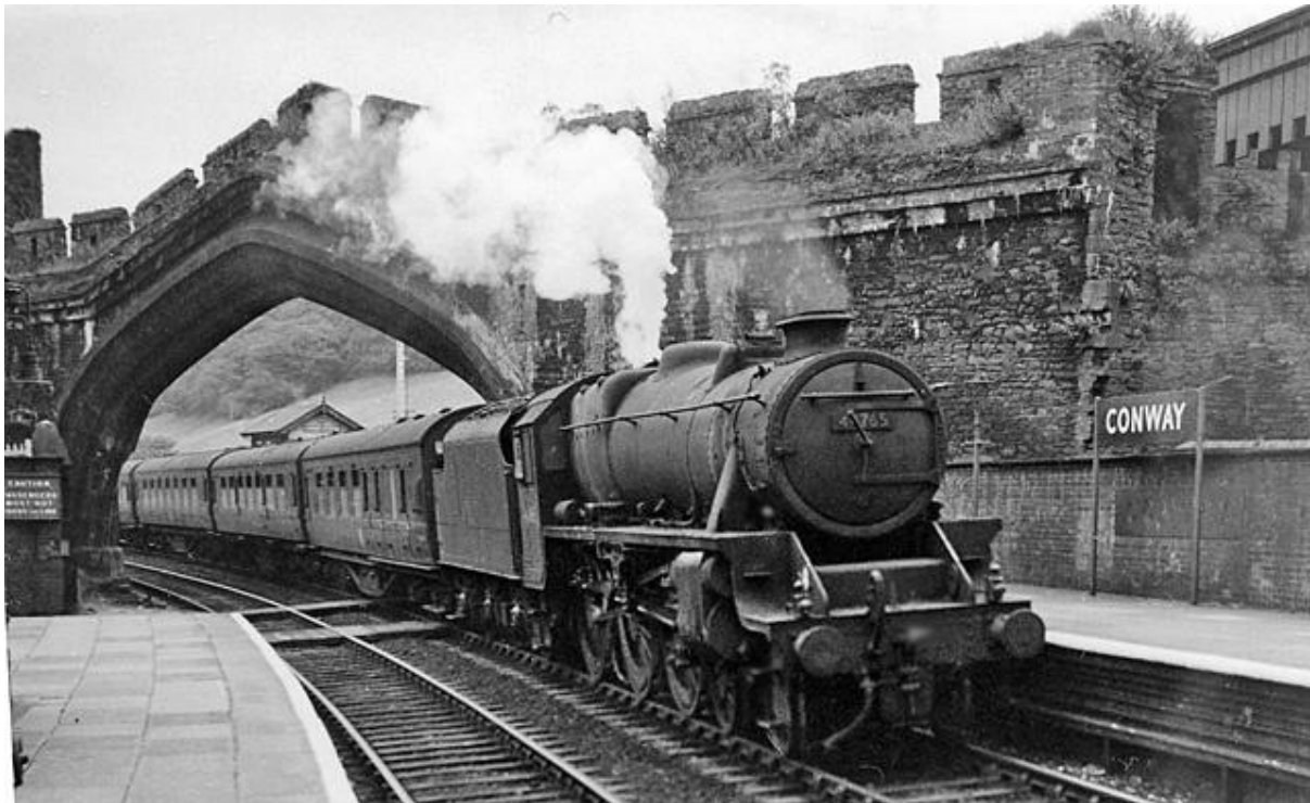
Conway station: double-chimney "Black 5" 44765 passes through the town walls with a Crewe to Bangor train in late summer 1962.

Tonight, Chris Youett returns us to Wales with We'll keep a welcome in the Valleys , part 4.