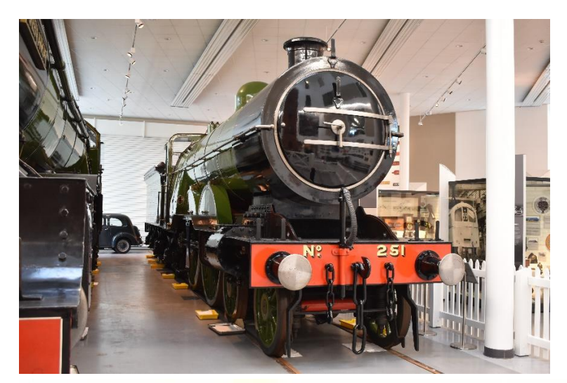
Great Northern Railway no. 251 at its new home, the Danum Museum in its Doncaster birthplace