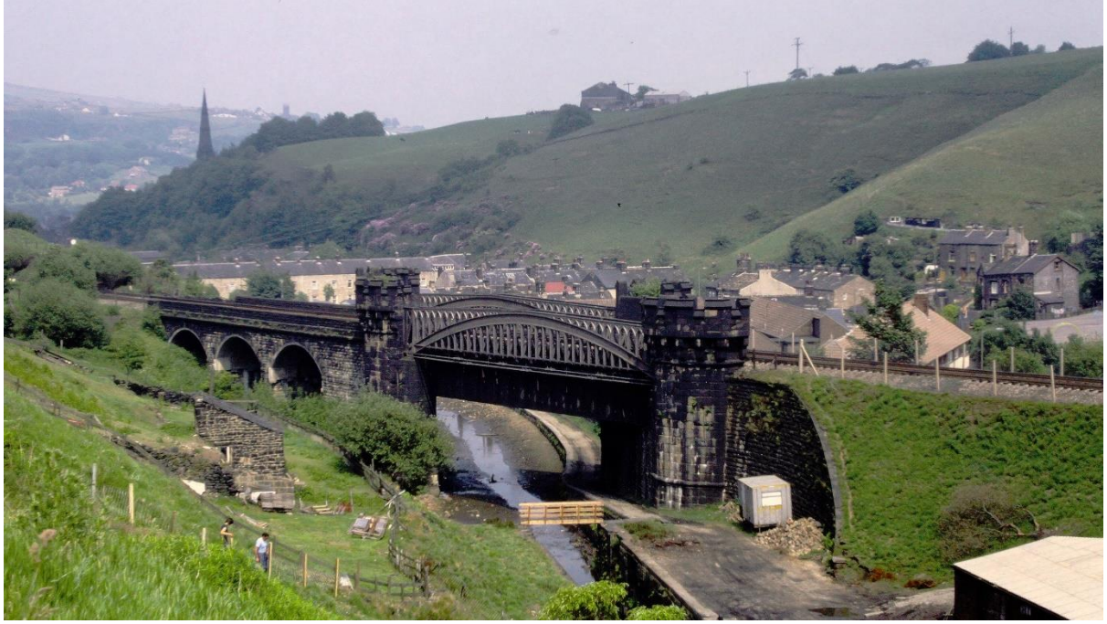
The editor's photographs show some of the engineering required to build a railway across the roof of England: Gauxholme Viaduct across the Rochdale Canal near Todmorden and Summit Tunnel's west portal at Littleborough.

Tonight, Stanley Jenkins will be giving a presentation Across the Pennines: Manchester to Leeds Main Line .